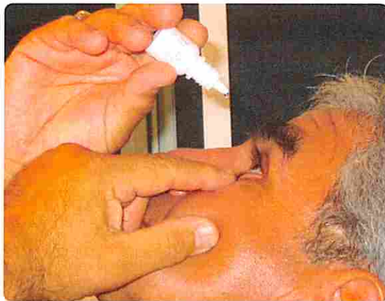
Artificial tears or steroid eye drops may help relieve redness, swelling or dry eye from blepharitis.

Antibiotics. Your ophthalmologist may have you use an antibiotic ointment on your eyes. Put a small amount of ointment on a clean fingertip or a cotton swab (Q-tip). Gently apply the ointment to the base of your eyelashes. Do this just before bedtime, or as your doctor recommends. Your doctor might prescribe an antibiotic medicine for you to take by mouth.