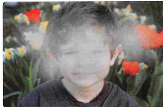
Blurring or dimming of vision