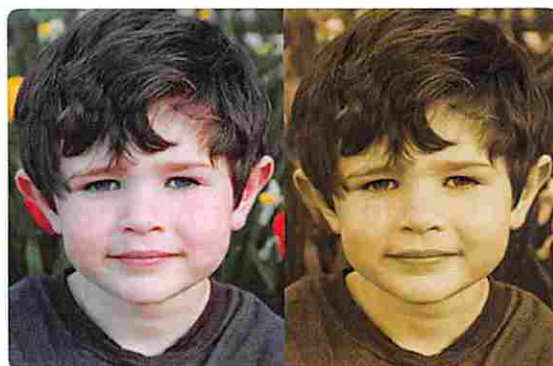
Left, normal vision. At right, dulled or yellowed vision.