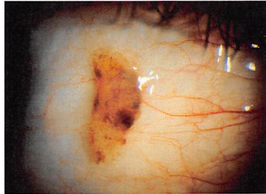
A nevus on the surface (conjunctiva) of the eye

Retina: Layer of nerve cells lining the back wall inside the eye. This layer senses light and sends signals to the brain so you can see.