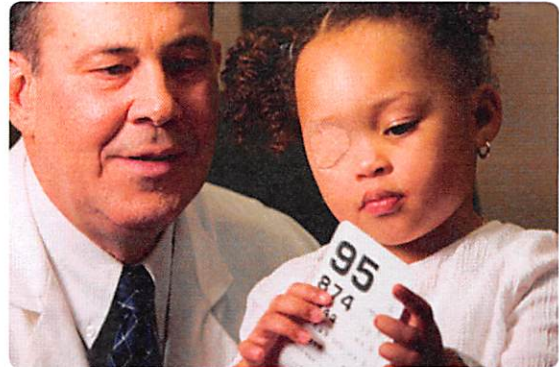
Patching a child's strong eye helps to strengthen the weaker eye.

Patching or blurring might be recommended to help strengthen a misaligned eye that is weaker than the other. The child is prevented from using their stronger eye by wearing an eye patch or using blurring eye drops. This forces them to use the weaker eye, helping to strengthen it over time.